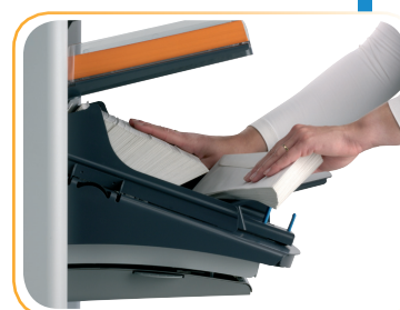
Optional Production Feeder