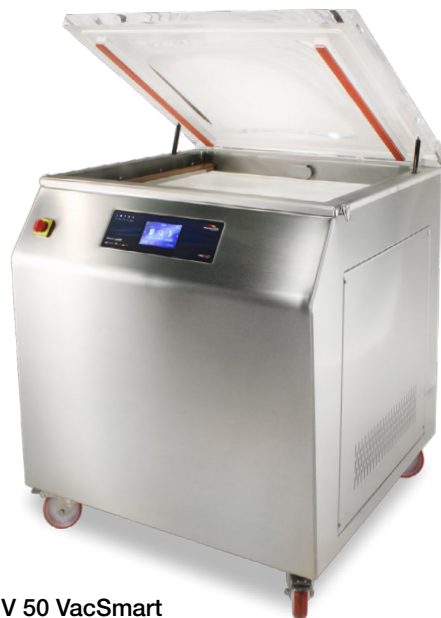
MV 50 VacSmart